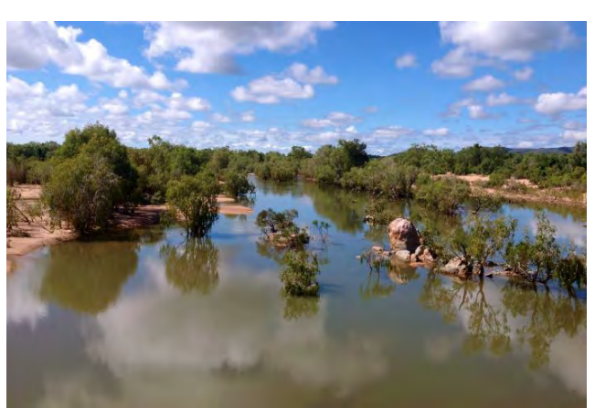
PHOTO: The $2 billion plan will use 500,000 megalitres of Einasleigh river water.