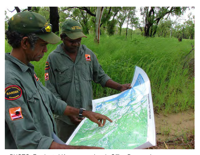
PHOTO: Feral arts | Kowanyama Lands Office Rangers | https://flic.kr/p/7GP7uG