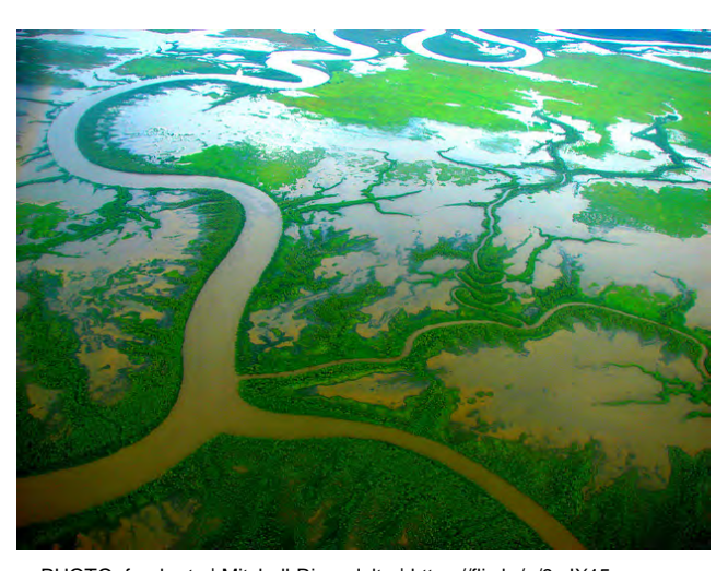
Mitchell River delta